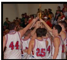
The Woodlawn Cardinals show off their hardware, earning 1st Place at the final Woodlawn Invitational Tournament.