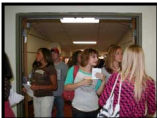
Students flood the halls on the first day of school to find their classes.